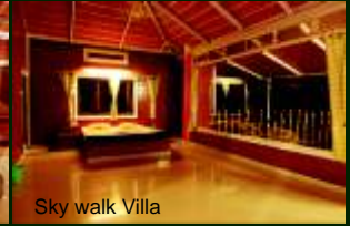
Sky walk Villa