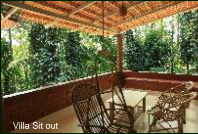
Villa Sit out