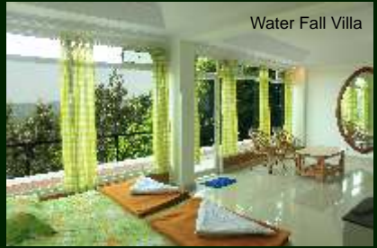
Water Fall Villa