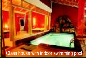
Glass house with indoor swimming pool