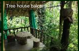
Tree house balcony